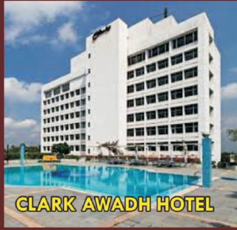
CLARK AWADH HOTEL